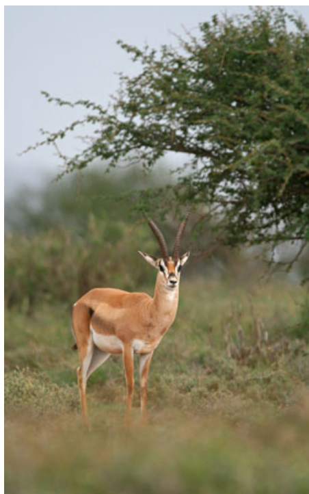
Fig. 1. Male Grant's gazelle.